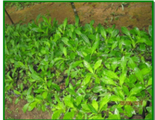
Chiraita seedlings raised in the nurseries