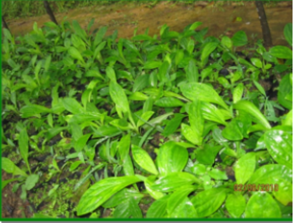
Chiraita seedlings raised in the nurseries