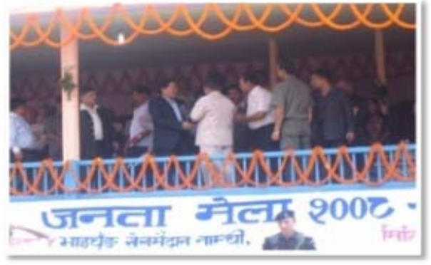
Distribution of financial assistance to contractual farmers during janta mela 2008 by the Hon'ble Chief Minister Shri Pawan Chamling