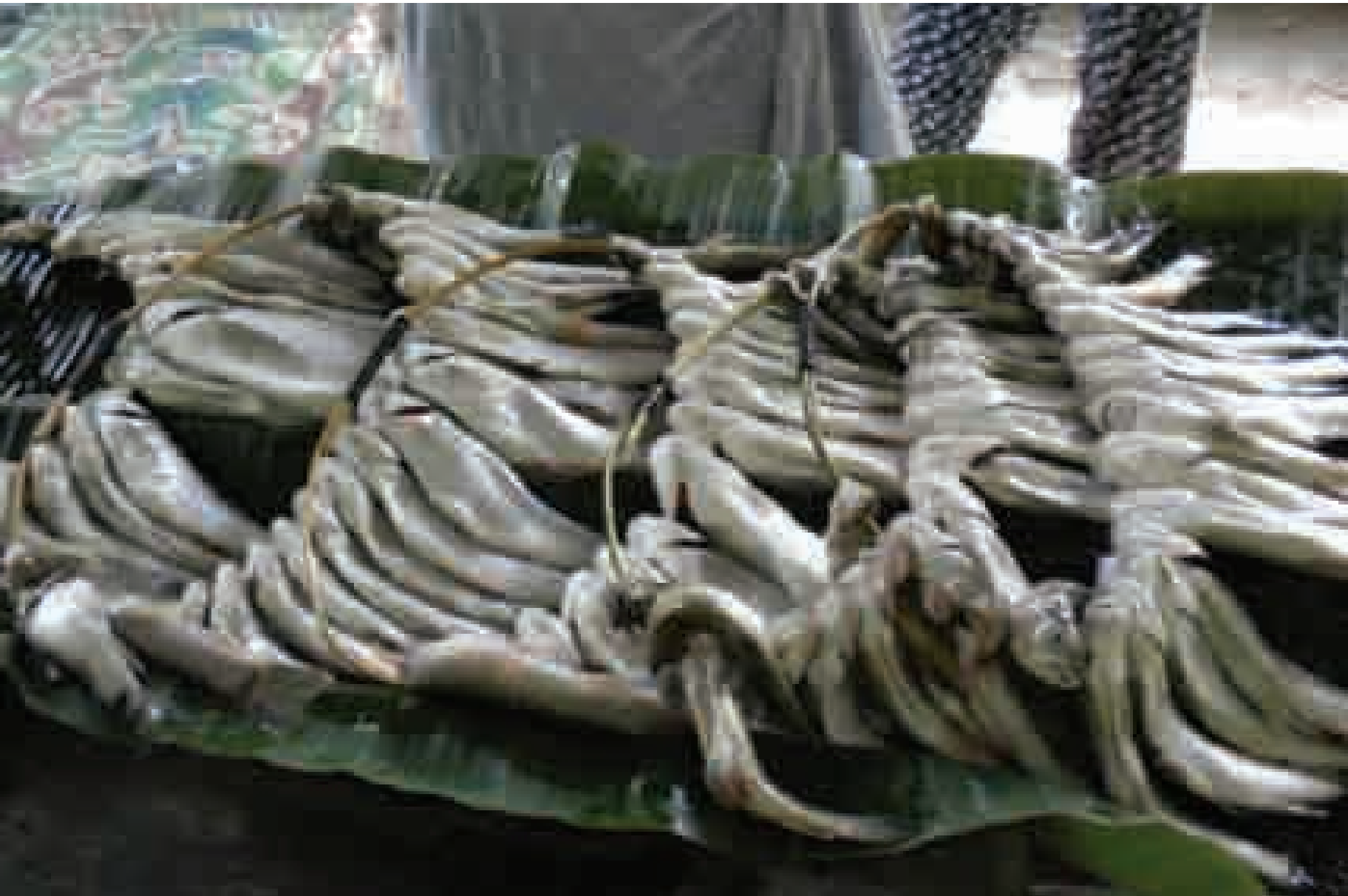
Catch fishes from river Teesta tributary in the local market for sale (East Sikkim)

KEYWORDS: cold water, fish biodiversity, physico-chemical parameters, Sikkim