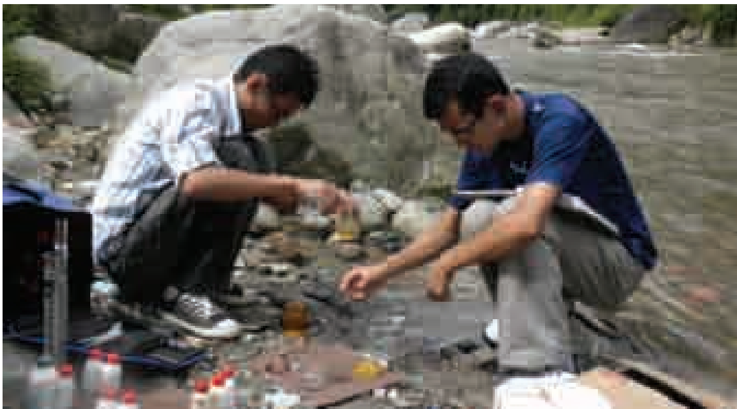
Measurement of physical and chemical characteristics of riverine water quality in Sikkim

The pH is considered as a measure of environmental suitability and a range of 7.0 to 8.5 is considered to support a rich biota and fish (Bell, 1971). In Teesta, mostly alkaline ranges of pH are observed, which can be correlated with a presence of biocarbonate alkalinity in Teesta water. However, pH in acidic range was recorded in Ranipool during monsoon season. The surface runoff and high turbidity during monsoon slightly bring down pH in river Teesta (Shardendu and Ambasht, 1988).