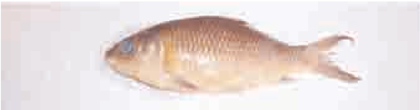
Semiplotus spp. (Chepti)