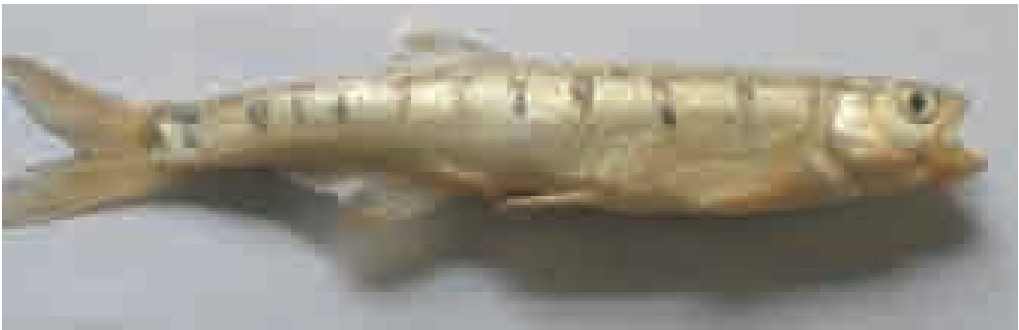
Barilius spp. (Chirkay)