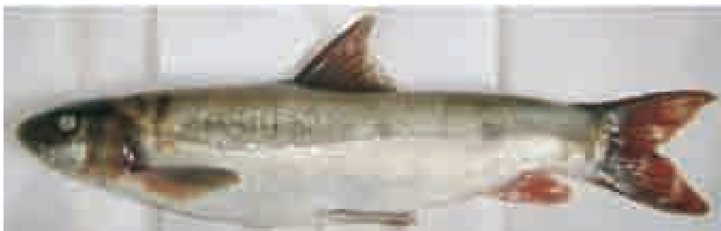
Schizothorax species (Asala)