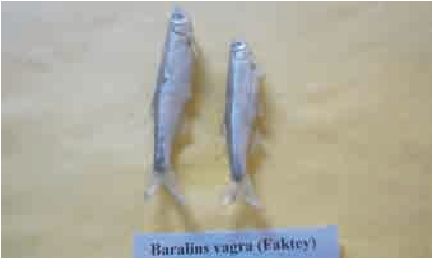
Baralius vagra (Fakty)