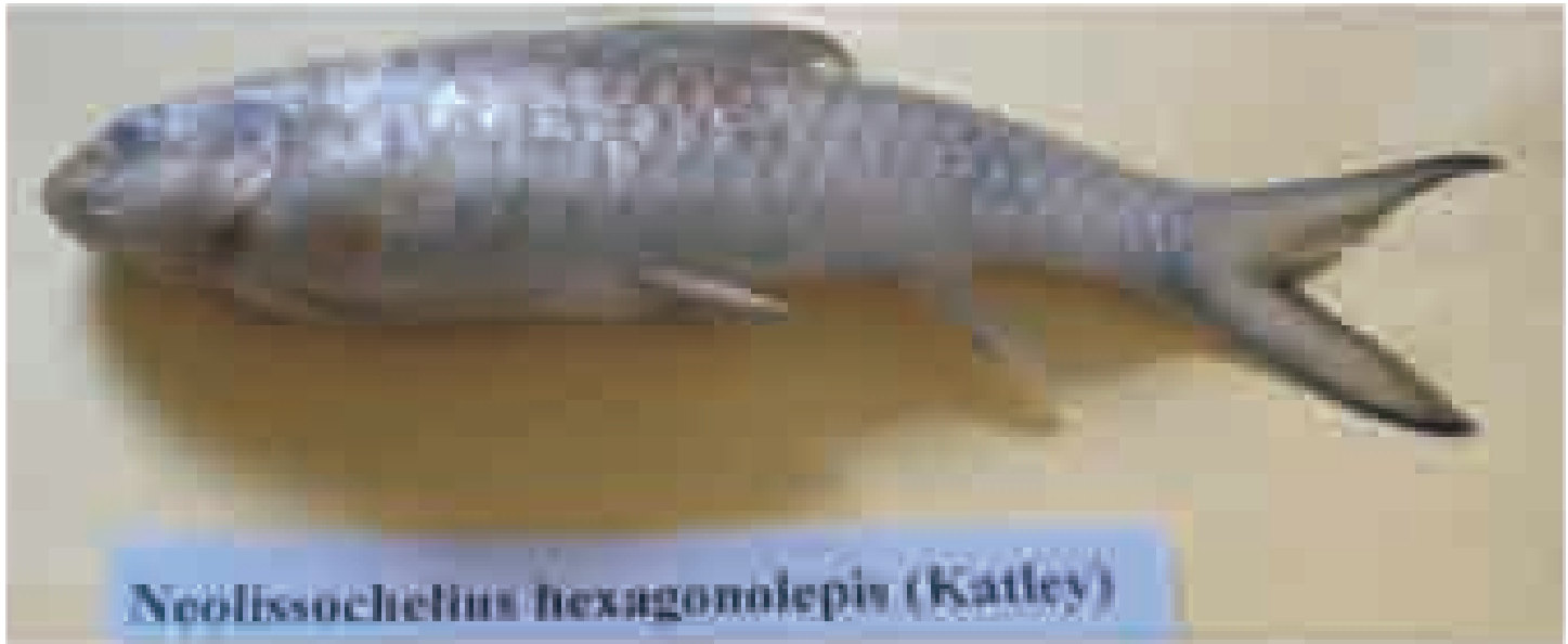
Neolissocheilus hexagonolepis (Katley)