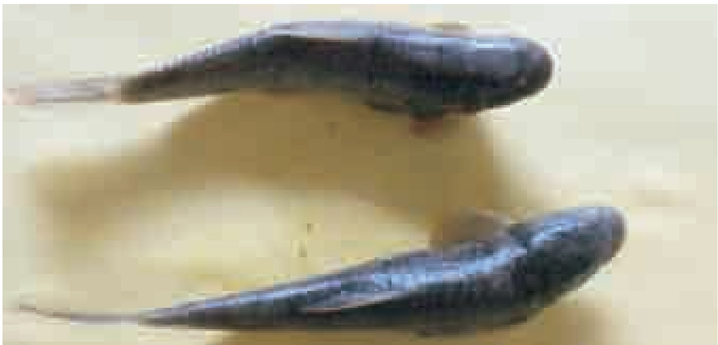
Garra spp. (Buduna)