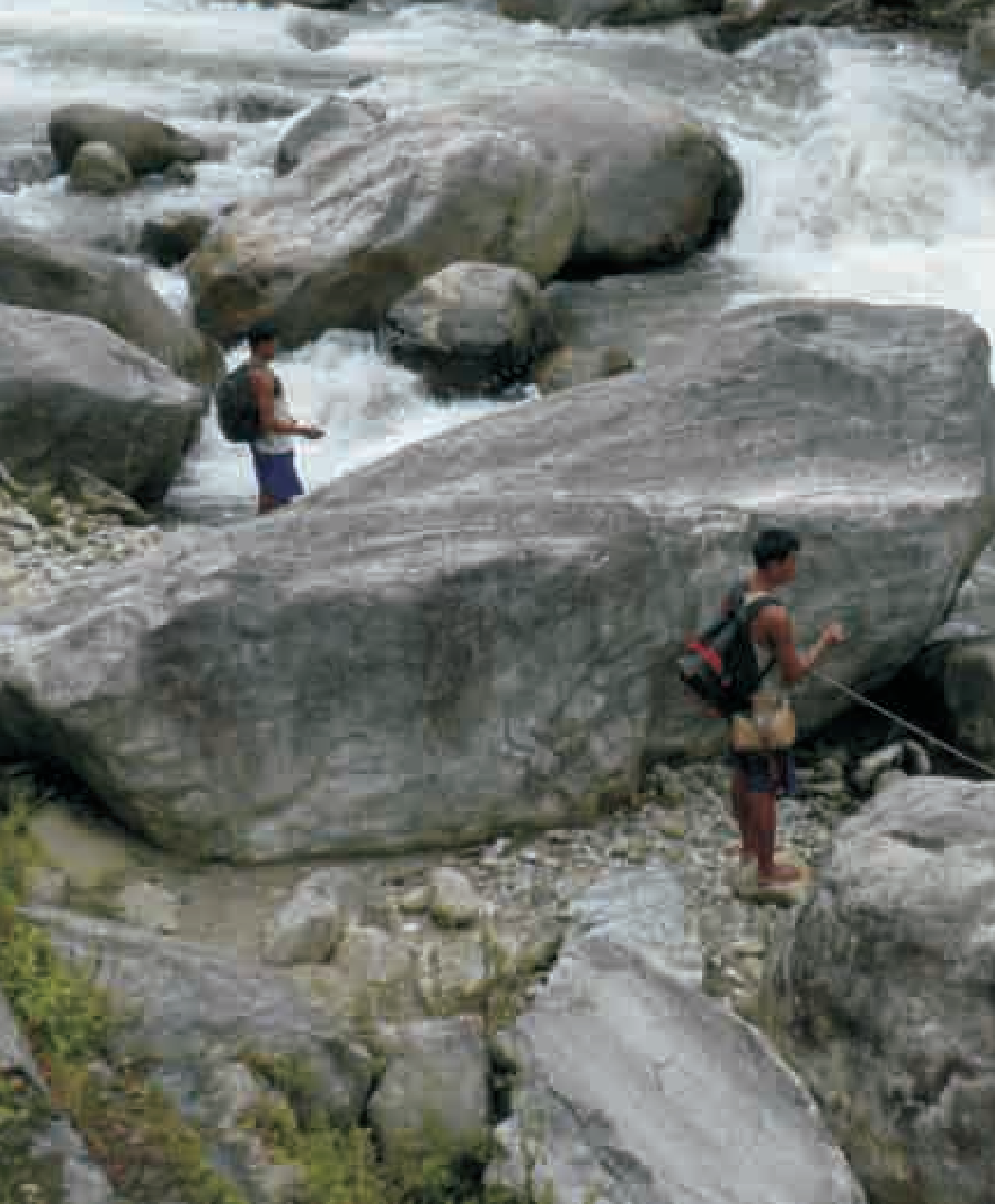
Fishing in river through rod and line in torrential stream