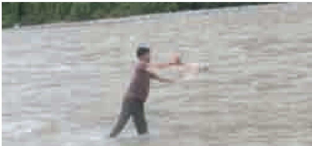
Fishing in river Rangit through cast net near Jorethang (South Sikkim)

observed and both the major rivers Teesta and Rangit and their tributaries extended their lower stretches through this district. During the month of May Schizothorax spp and Neolissocheilus spp comprised 78.82 percent of the catch. This could be related to the migratory behaviour of the fish during summer to monsoon. During this season Neolissocheilus spp moved to smaller tributaries from main stream and Schizothorax spp moved to down streams (MOEF, 2002) and caught in maximum number in the South district. Higher fishing durations were also observed in this district. Lower availability of fish catch during rainy season might be due to high current in the over-flooded rivers.