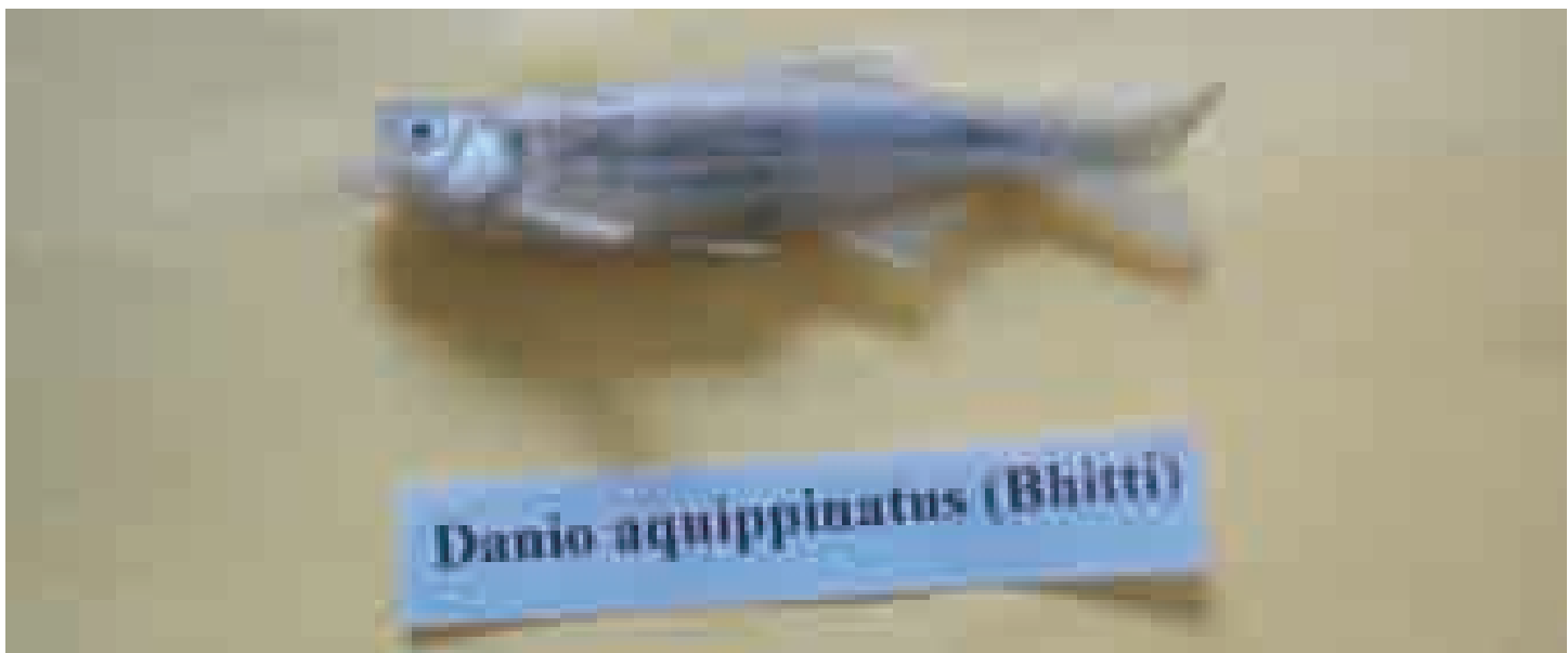
Danio aequipinnatus (Bhitti)

The fish species distribution in the Himalayan streams depends on the flow rate, nature of substratum, water temperature and the availability of food. In torrential streams Sehgal (1988) identified several zones on the basis of dominant fish species and the hydrographical features. Menon (1954) related the distribution pattern of Himalayan fish to morphological characteristics which enable them to inhabit the torrential streams. He recognized six major groups: (a) fish dwelling in shallow, clear cold waters in the foothills without any striking modifications to current: Labeo , Tor , Barilius and Puntius ; (b) fish inhabiting the bottom water layers in deep fast current, with powerful muscular cylindrical bodies: schizothoracines and the introduced trouts; (c) fish sheltering among pebbles and stones to ward off the strong current: Crossocheilus diplochilus ; (d) fish sheltering among pebbles and shingles in shallows, with special attachment devices: the loaches Noemacheilus , Botia and Amblyceps ; (e) fish which cling to exposed surfaces of bare rocks in slower current, with adhesive organs on their ventral surface for attachment to rocks: Garra , Glyptothorax and Glyptosternum ;