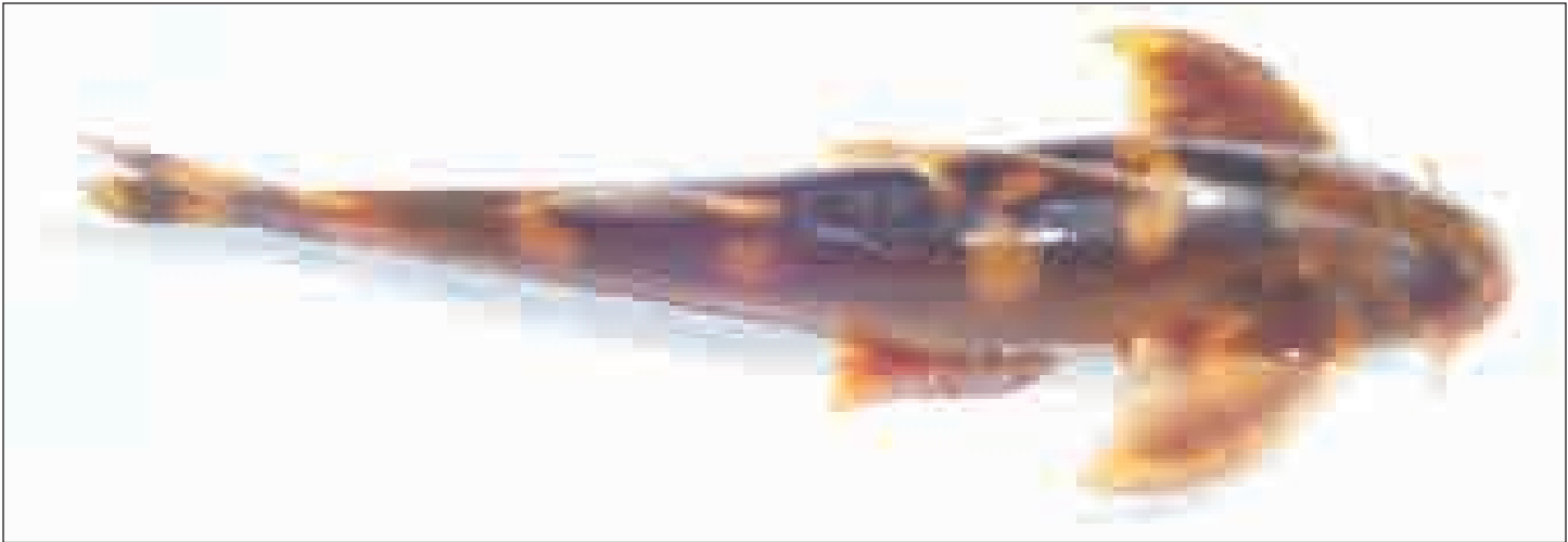
Pseudecheneis sulcatus (Kabrey)