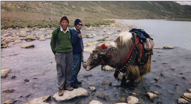
SBSAP Team in the cold desert at Lhonak