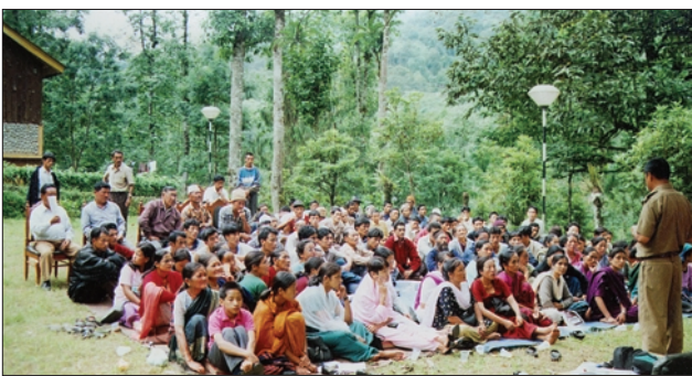
Public Hearing at Soreng, West Sikkim