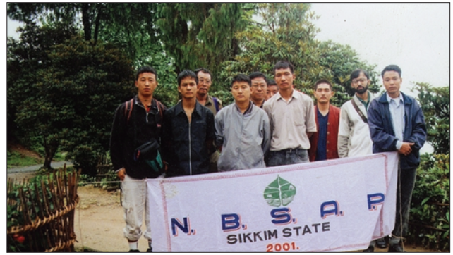
NBSAP Team at Hilley, West Sikkim