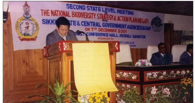
Presentation of NTFP SAP