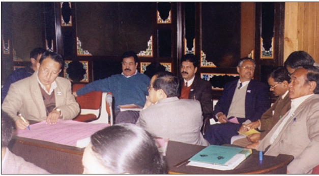
Forestry & Biodiversity GSAP group discussion