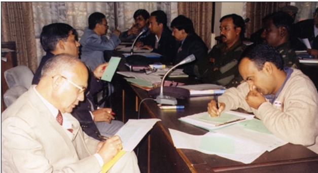
Mining, Hydel-project (NHPC GSAP group discussion)