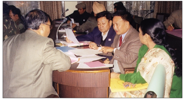
Eco-Tourism and Biodiversity GSAP group discussion