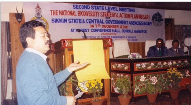
Presentation of Aquatic Ecosystem SAP