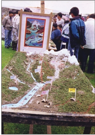
Model of the Khangchendzonga Ntl. Park