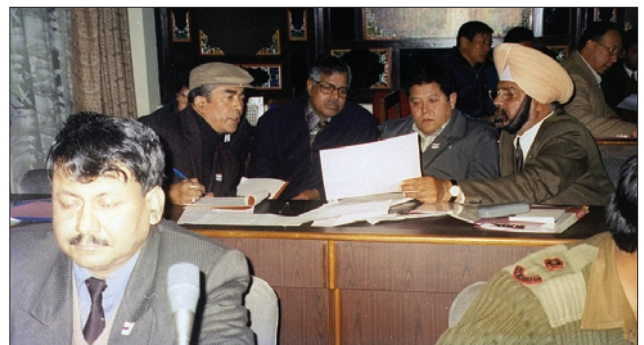
NTFP working group during 2nd SLM