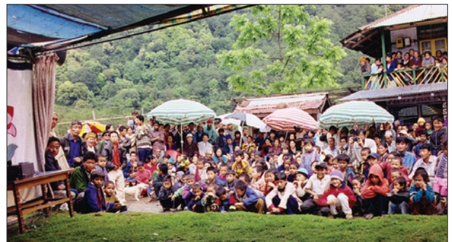
Public response at 'Dharma Dhoka' play, Yoksum