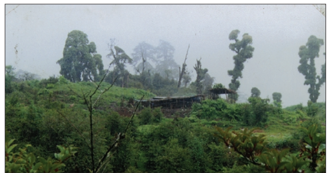
Effect of Cattle-shed or 'goth' in the forest