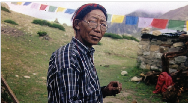
A Dokpa (Nomadic Tibetan Pastoralist) at Muguthang