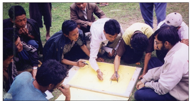
Resource Mapping of Karjee