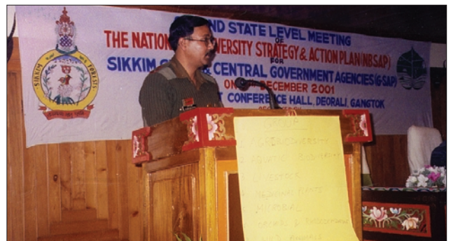
Presentation of Army SAP