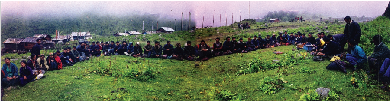
NBSAP hearing of Lachenpas at Thangu, North Sikkim celebrating Drukpa Tseshi