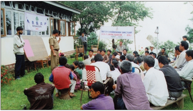
Public Hearing at Sombaria, West Sikkim