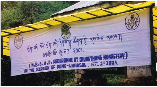
SBSAP banner in Lepcha during Pang Lhabsoi, North Sikkim