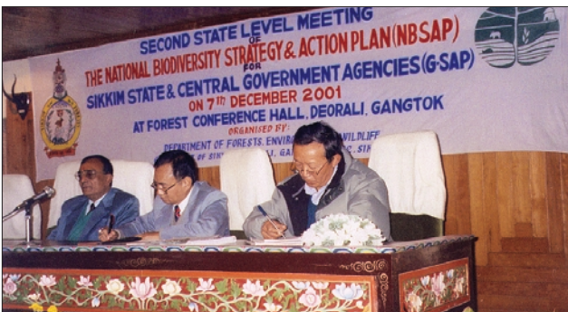
2nd State Level Meeting at Gangtok