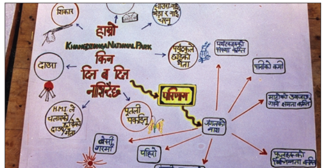
Chart of threats to Khangchendzonga Ntl. Park