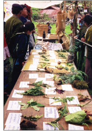
NTFP and Handicrafts Exhibition