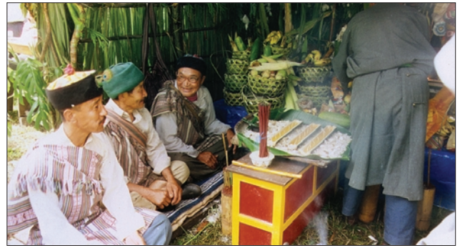
Biodiversity linked with 'Pang Lhabsoi' worshipping Mt. Khangchendzonga