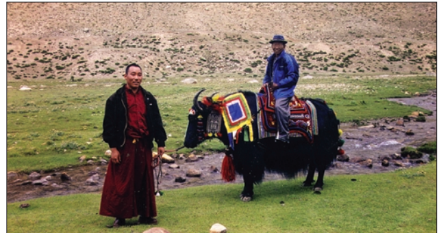
Religion in Sikkim protects Biodiversity