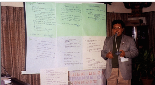
Presentation of Microbial Diversity SAP