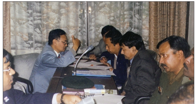
Agri-Diversity GSAP group discussion