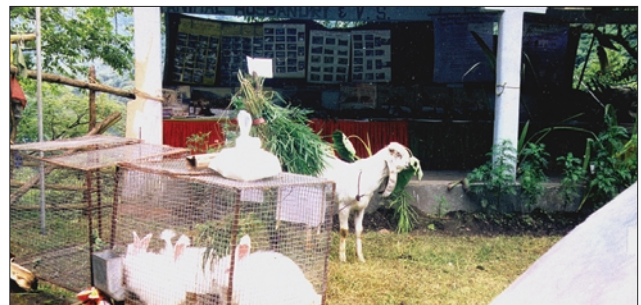
Exotic Livestock displayed during 'Pang Lhabsol' Biodiversity Mela