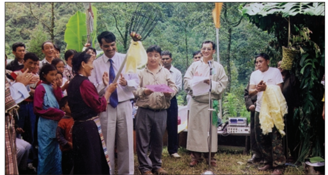
Emphasis on women's role in Biodiversity conservation