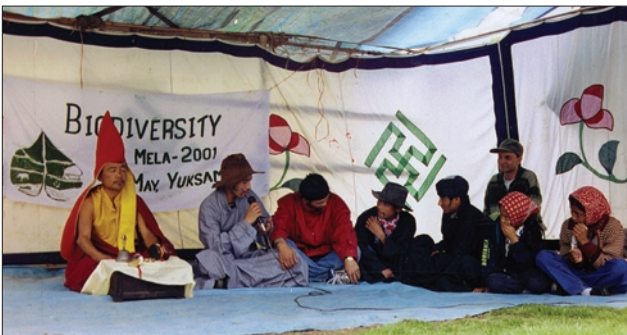
Conservation & Religion: A Play "Dharma Dhoka"