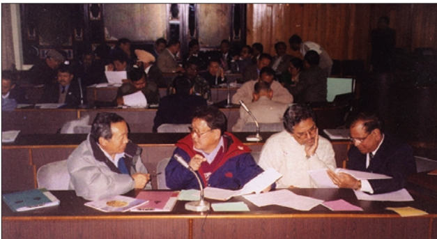
Orchids and Medicinal plants GSAP group discussion