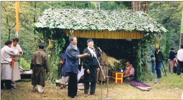
Bhutia folklore on Biodiversity during festival